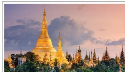
Shwe Dagon Pagoda