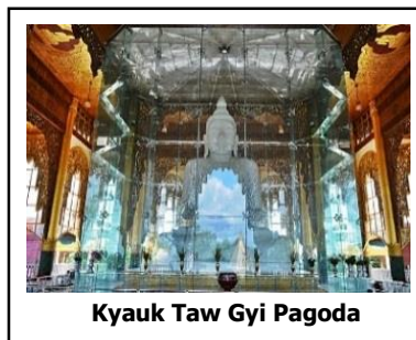
Kyauk Taw Gyi Pagoda

Dinner at outside local restaurant and overnight at the hotel in Yangon.