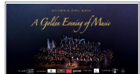
Myanmar Music Festival