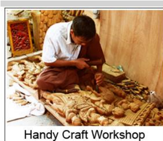
Handy Craft Workshop

Lunch will be served at outside local restaurant. Start the tour excursion with handy crafts workshops, Kuthodaw Pagoda - known as the world's largest book with its 729 marble engraved with Buddhist scriptures. The evening ends with a breathtaking sunset view offered at Mandalay Hill. Dinner at outside local restaurant and overnight at the hotel in Mandalay.