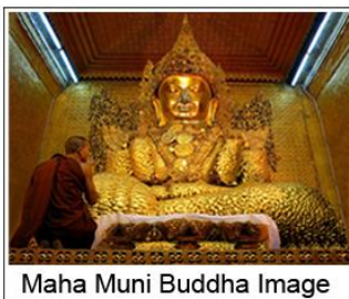
Maha Muni Buddha Image

Breakfast at the hotel. Morning sightseeing starts with Maha Muni Buddha Image, Shwenandaw Monastery - noted for its exquisite wood carvings and Atumashi Monastery. Lunch will be served at outside local restaurant. After that, visit to Ava by boat and pass through the ancient city walls with the old school style horsecart to visit a brick and stucco monastery called Maha Aungmye Bonzan (also known as Oak Kyaung). Continue to see Nanmyint Tower , and wooden monastery of Bagaya Kyaung. Return back to Mandalay. Dinner at outside local restaurant and overnight at the hotel in Mandalay.