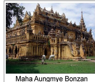
Maha Aungmye Bonzan