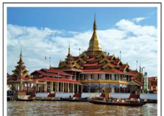
Phaung Daw Oo Pagoda